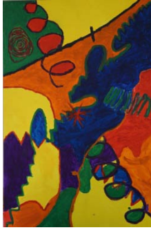
Art/Photography #90 "Emotions Through Lines"— Grade 4 Art

(Contact Mary Reiling: mreiling@fids.org)