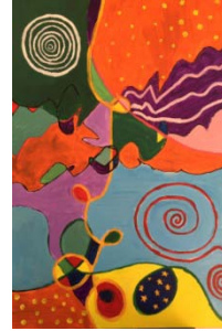
Art/Photography #91 "Assortment of Lines" — Grade 5 Art Donated by:

"Assortment of Lines" Gr. 5 Oil Pastel and Art Acrylic on Canvas, 24" x36." The children were introduced to the art of Wassily Kandinsky, a Russian painter, recognized as producing the first abstract painting. He explored how to represent the elements of music. Like Kandinsky, the children focused on the elements of line and dot.